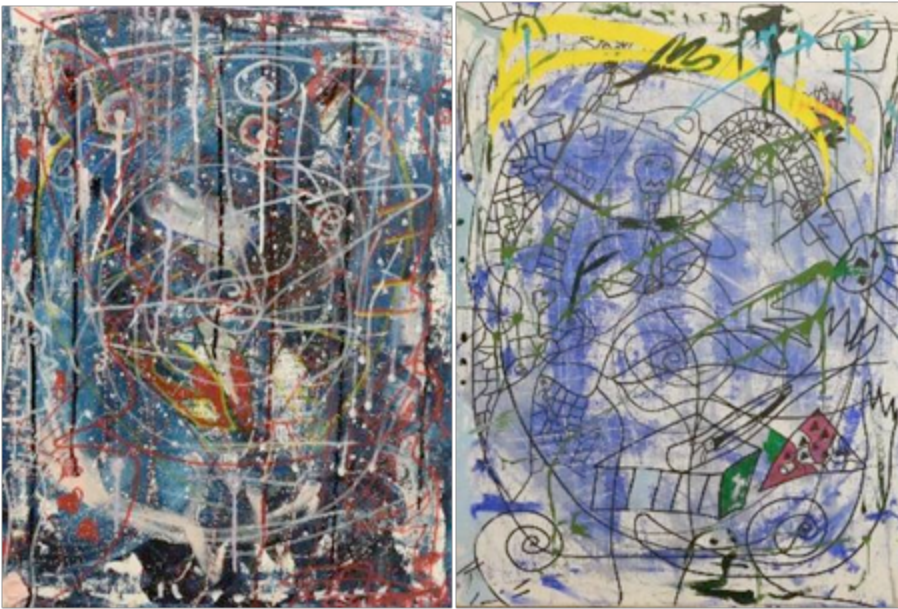
Artworks: Strange Hearts (24" x 18"), Aftermath (30" x 40"), Ryan Spiritas 2016