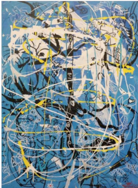
Artwork: Blue Lenin, Ryan Spiritas 2016 (40" x 29.5")

A full biography, b-roll, video clips and high resolution 300 dpi photography are available upon request @ allison@relevantcommunications.net