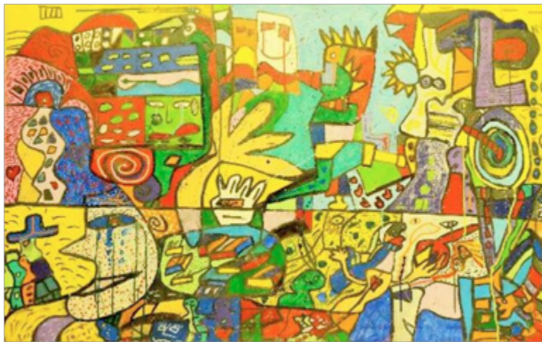
Drawing: Cacophony 2015

Spiritas is a modern contemporary expressionist whose artistic style emotes a refreshing, yet twisted, portrayal of the 21st-century avant-garde through an exploitation of color. Many of his works are like views through a cacophonous lens of dysfunction that exists in his subconscious mind. As such, his pieces reflect the accumulated memories and experiences that have lingered in his head for many years with no way to escape. Spiritas, who describes himself as “strangely productive” strives to promote an irrational juxtaposition of imaginatively drawn images that direct the viewer into the world of daydreaming, yet contrast with random dark deliberations that still give a lighthearted feel to his creations.